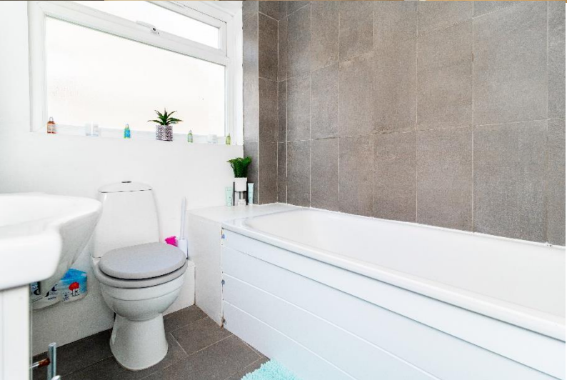
HEREFORD COURT, CANNING ROAD CROYDON, SURREY, CR0 6QD